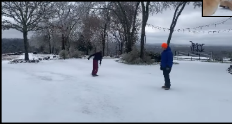
The Chambers family enjoyed some unusually wintry weather at their new home in Texas.