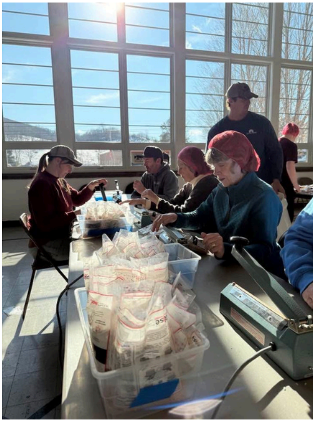
Church members participated in the 'Rise Against Hunger' food packaging event organized by Blue Grass United Methodist..