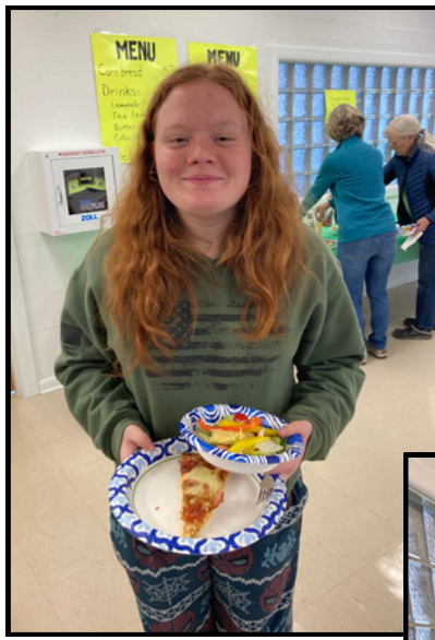
Monterey Presbyterian hosted a time of fellowship and bible reading at Slices and Scripture on March 18.